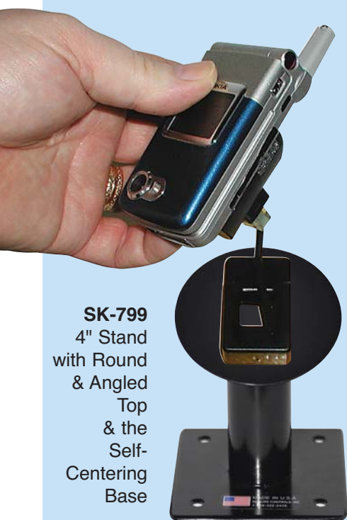
SK-799 4" Stand with Round & Angled Top & the Self-Centering Base