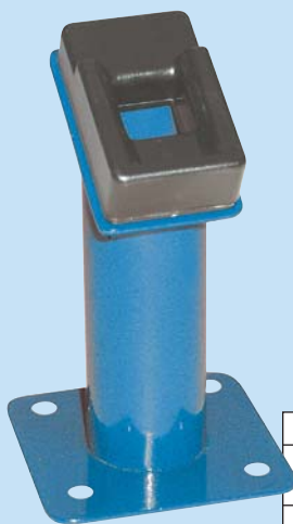
SK-798-4 A Special Stand Designed to Fit the Self-Centering Base

The Sensor is Magnetically Attracted to the Self-Centering Base