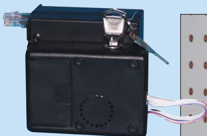
Stand Alone Alarm Module with Electronic Recoiler®

The Stand Alone Alarm incorporates the security of an alarm, an electronic recoiler and the ability to deliver power to a small electronic device in a single package. It can be provided with an acrylic display that can be mounted on slatwall or pegboard, or sold separately and used with your fixture.