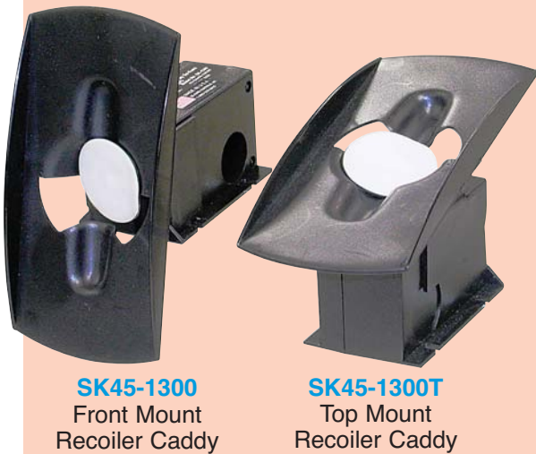
SK45-1300 Front Mount Recoiler Caddy

The Perfect Way to Display Remote Controls or Cellular Phones