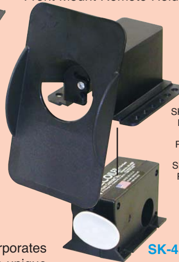
SK45-1100 Remote Holder Requires the SK-4500G Recoiler