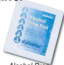
Alcohol Prep Pads are Included in the Kit

1. Locate and clean the surface on the 4 corners of the mirror back where it will be mounted. Clean the surface with an alcohol prep pad then Wipe the Surface Dry with a Clean Paper Towel .