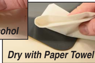
Dry with Paper Towel

2. Remove the carrier paper from the double adhesive (included in the kit) and press it FIRMLY into place on the 4 back corners of the mirror that you have cleaned and dried with the alcohol prep.