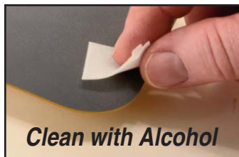
Clean with Alcohol