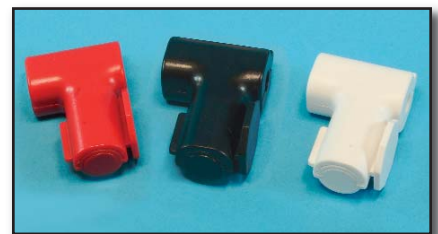
Extended Peg Hook Locks are Available in Red, White, & Black

For Additional Information, Contact Customer Service at: 1-800-322-2435